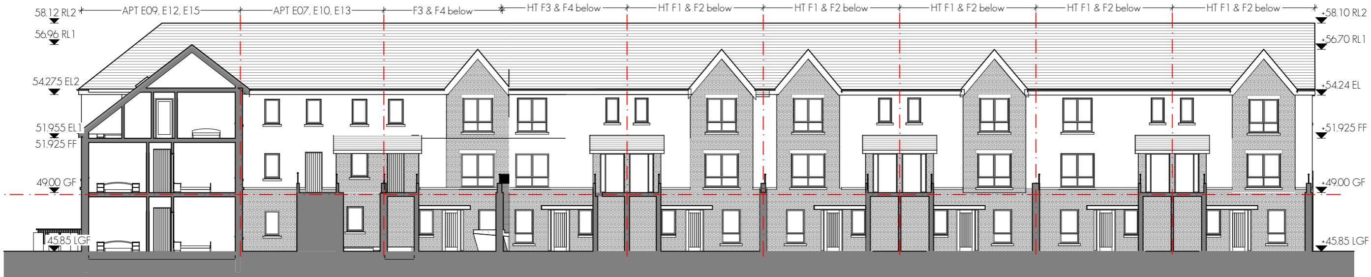
CONTEXTUAL FRONT ELEVATION (SOUTH WEST) - SHOWING LOWER LEVEL