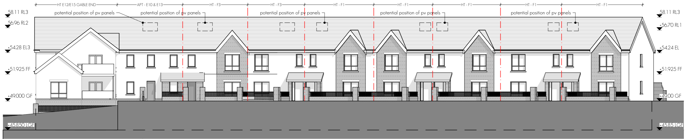
CONTEXTUAL FRONT ELEVATION (SOUTH WEST)

THIS DRAWING IS FOR PLANNING PERMISSION PURPOSES ONLY. FURTHER DRAWINGS AND STUDIES WILL BE REQUIRED FOR CONSTRUCTION AND TO ENSURE COMPLIANCE WITH RELEVANT BUILDING REGULATIONS AND STANDARDS. NOTE: PLEASE REFER TO THE SITE LAYOUT DRAWING FOR ALL FFLS AND THE NORTH POINT ORIENTATION